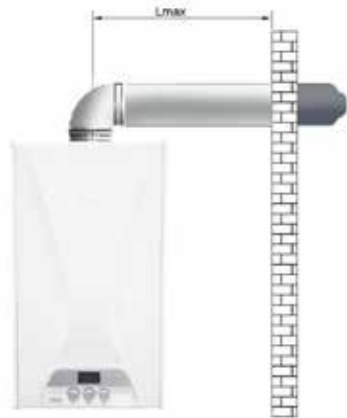
Horizontal Hermetic Flue Application L max. distance with single elbow: 4 m, Ø60/100 L max. distance with single elbow: 6 m, Ø80/125